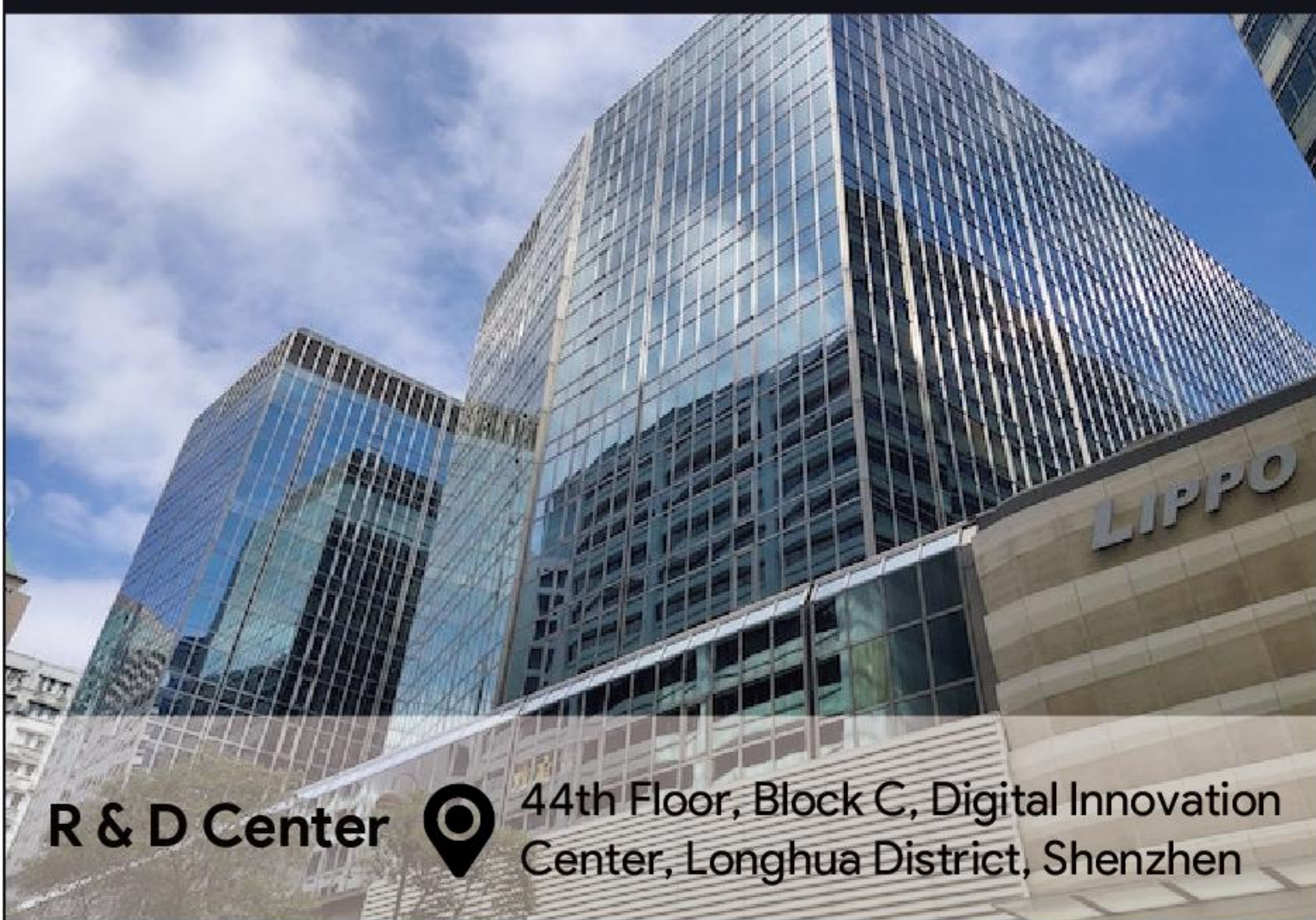
R & D Center