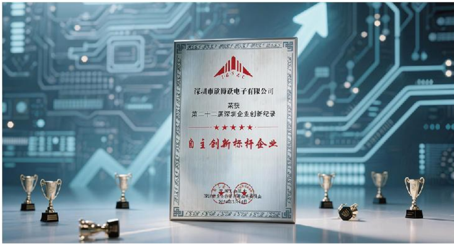
Benchmark Enterprise for Independent Innovation