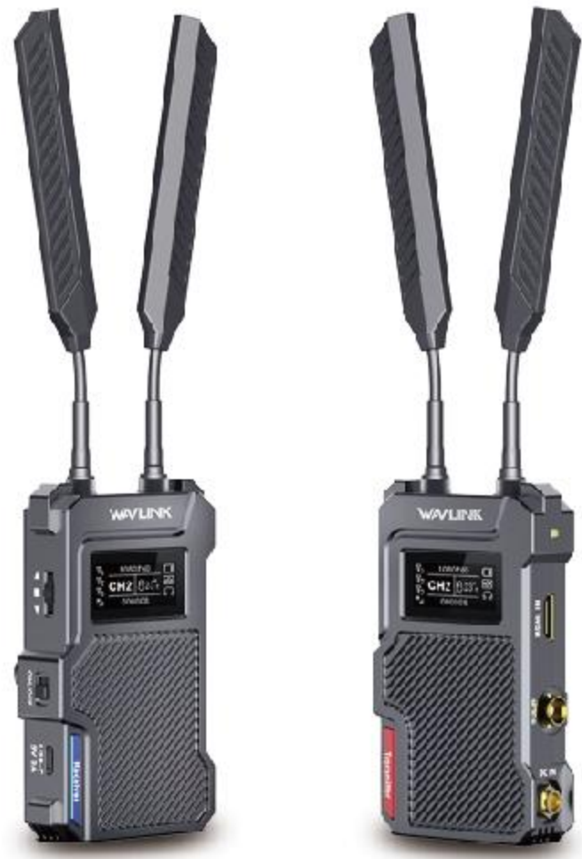
Wireless HDMI Transmission