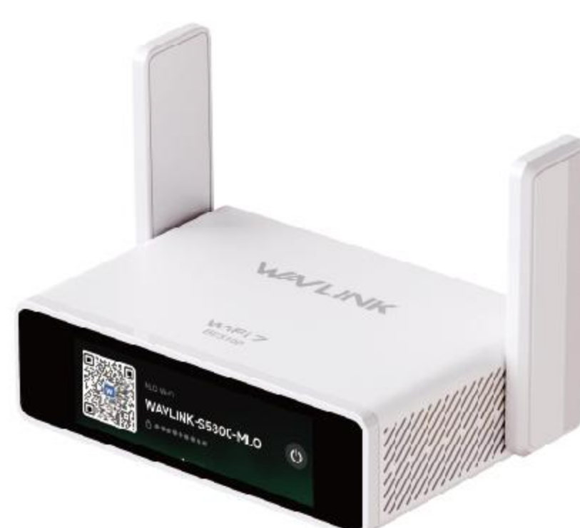
WiFi 7 BE5100 Portable Travel Router