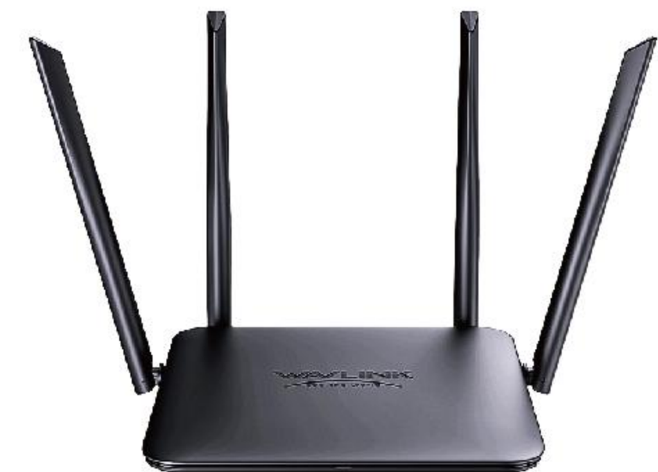
WiFi 7 BE5100 Wireless Router with Mesh