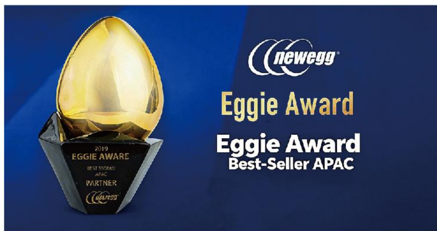
Eggie Award Best-Seller APAC