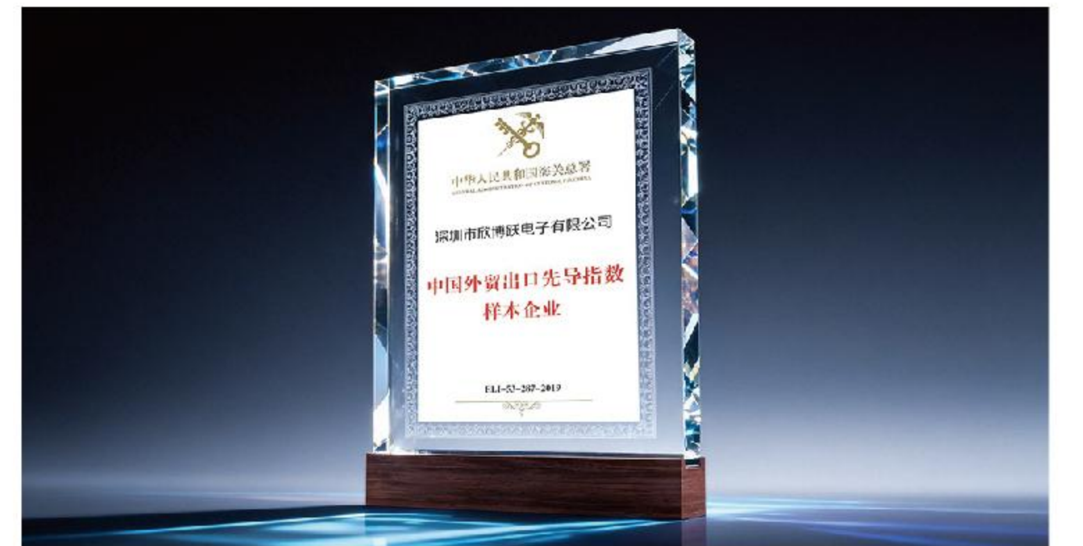
Sample Enterprise of China Foreign Trade Export Leading Indicator