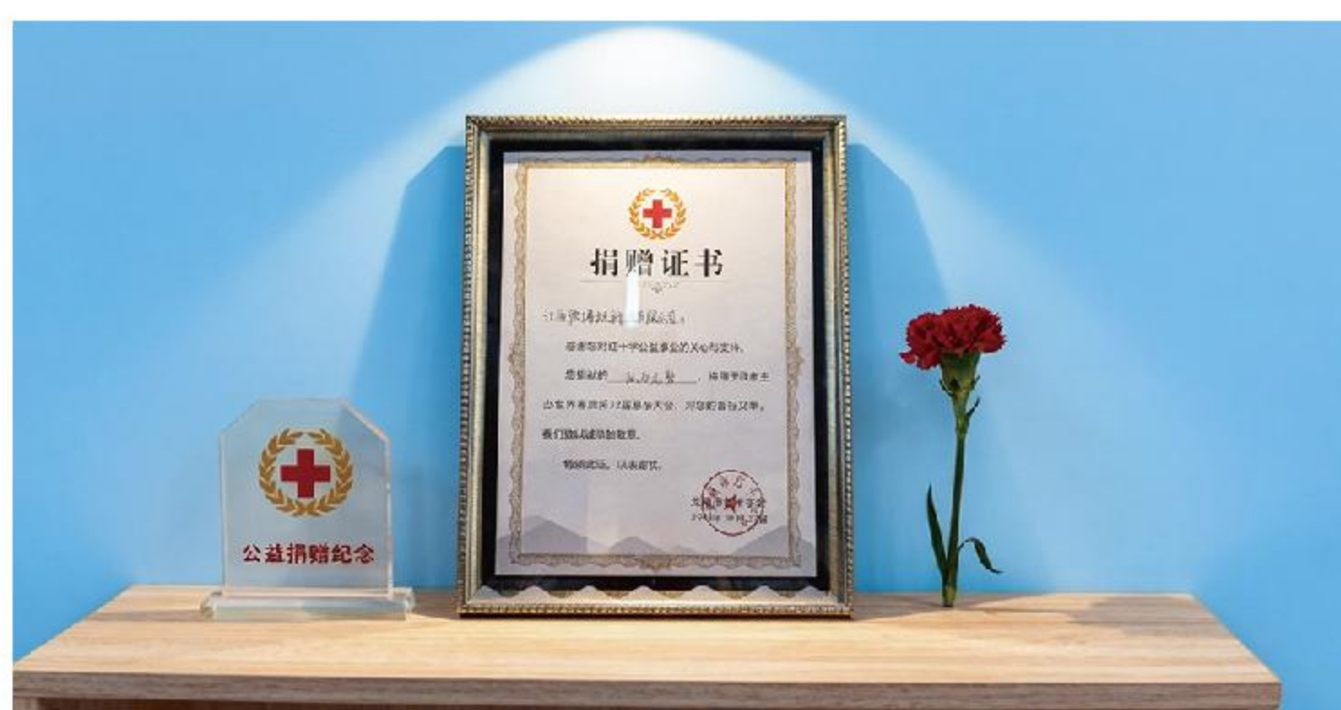
Donation for World Hakka Conference