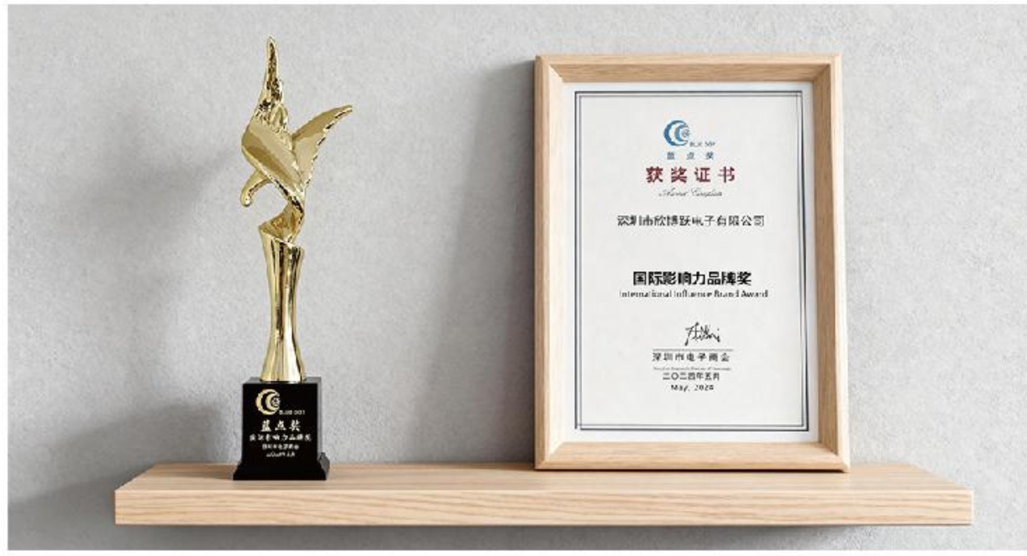
International Influence Brand Award: Wavlink