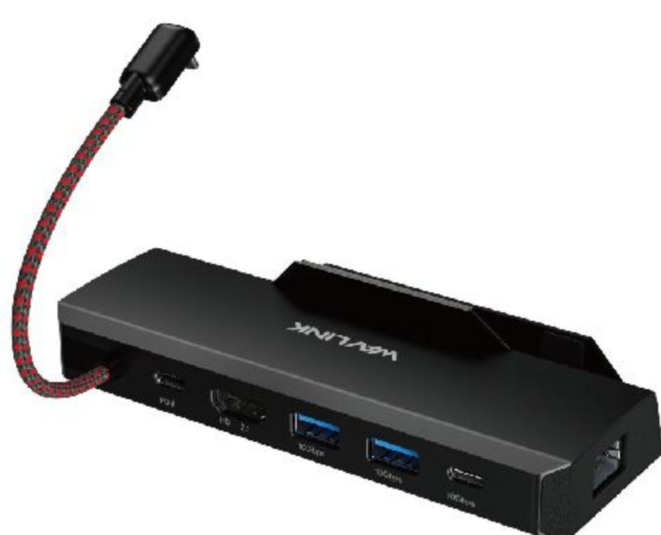
USB Travel Dock with M.2 NVMe Enclosure