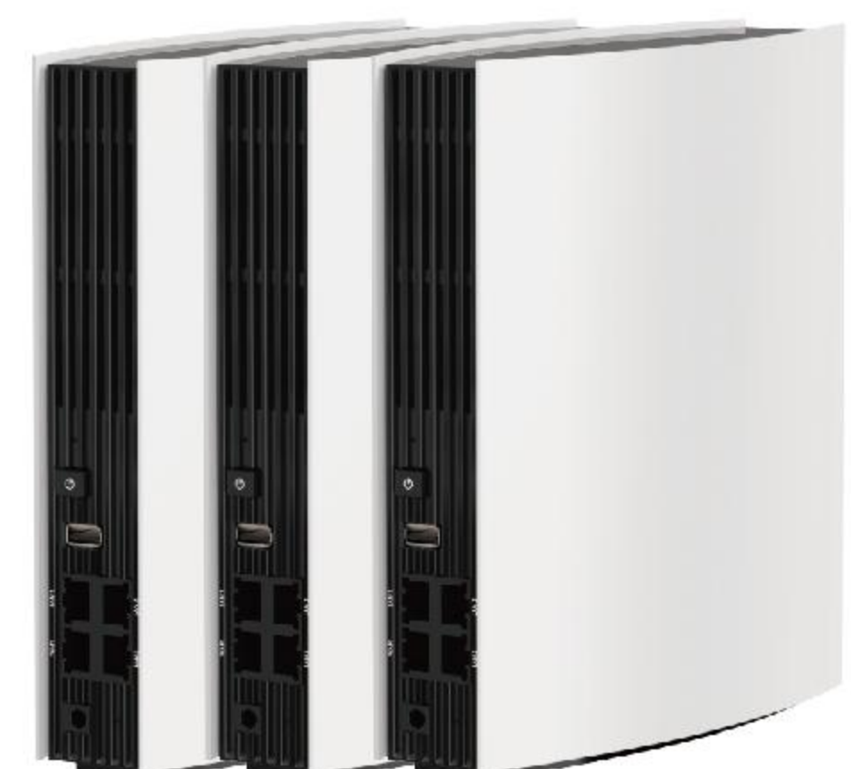
WiFi 7 BE14000 Mesh Router