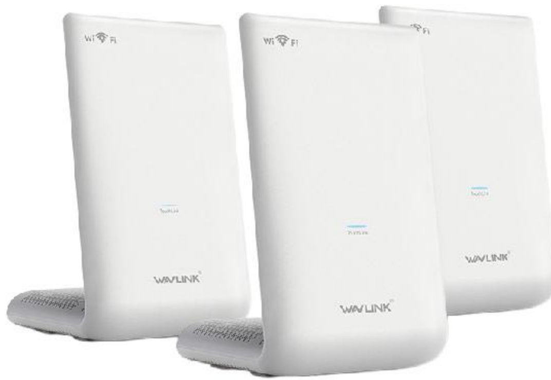
Wi-Fi 7 BE5100 Wireless Mesh Router