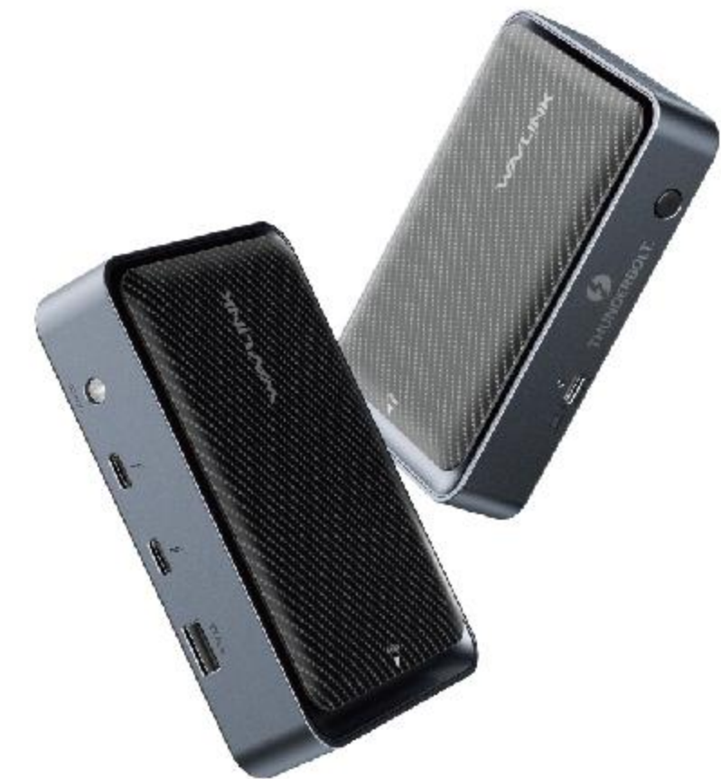
Thunderbolt 4 Docking Station