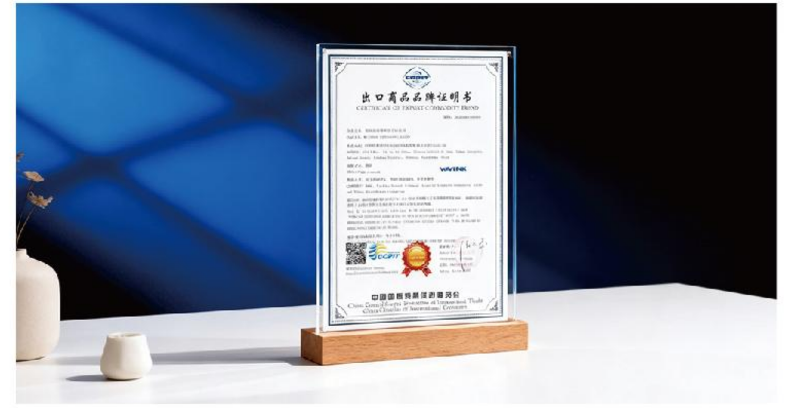
Certificate of Export Commodity Brand: Wavlink