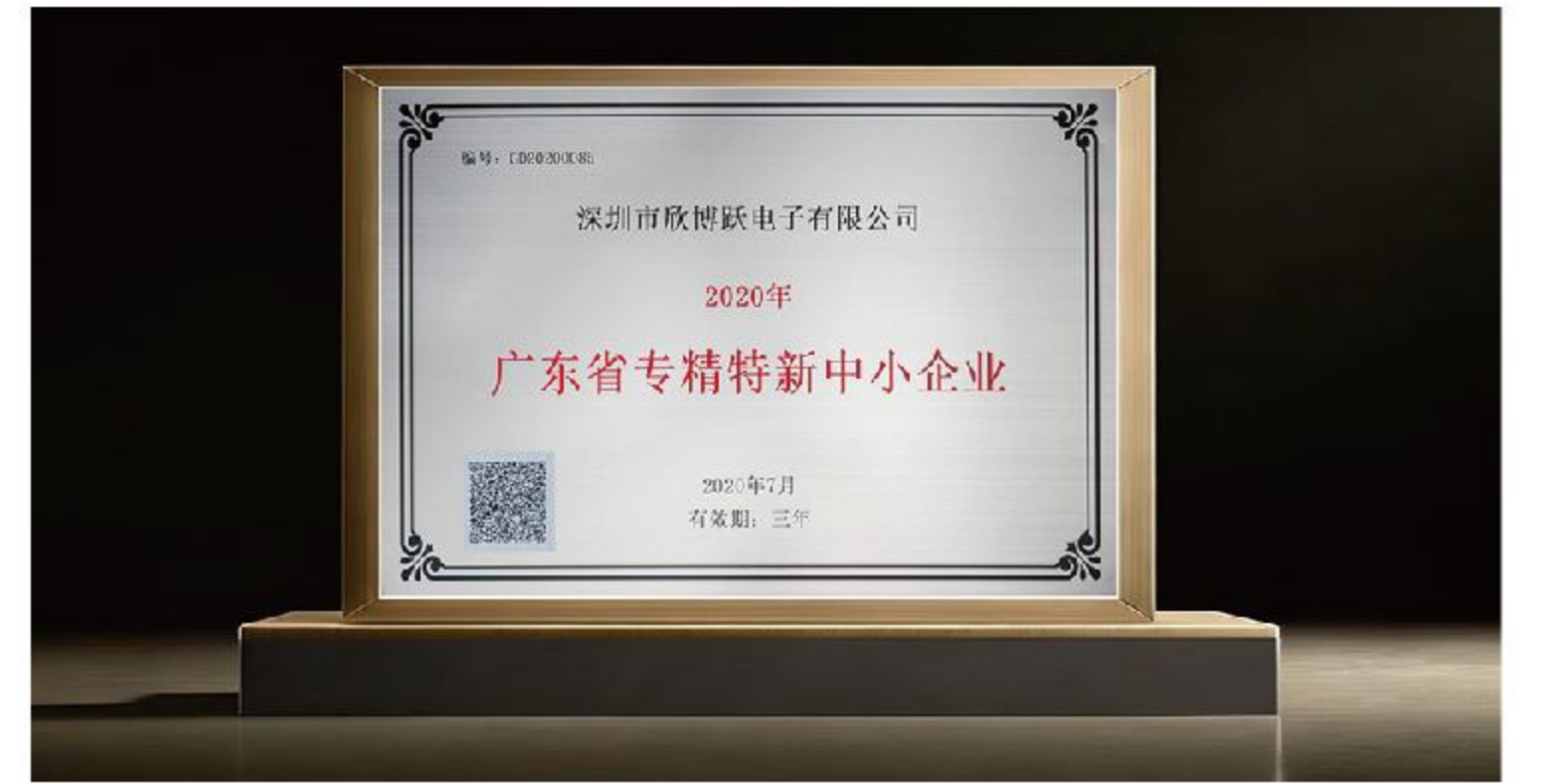
Specialized, Sophisticated, Distinctive and Novel Enterprise