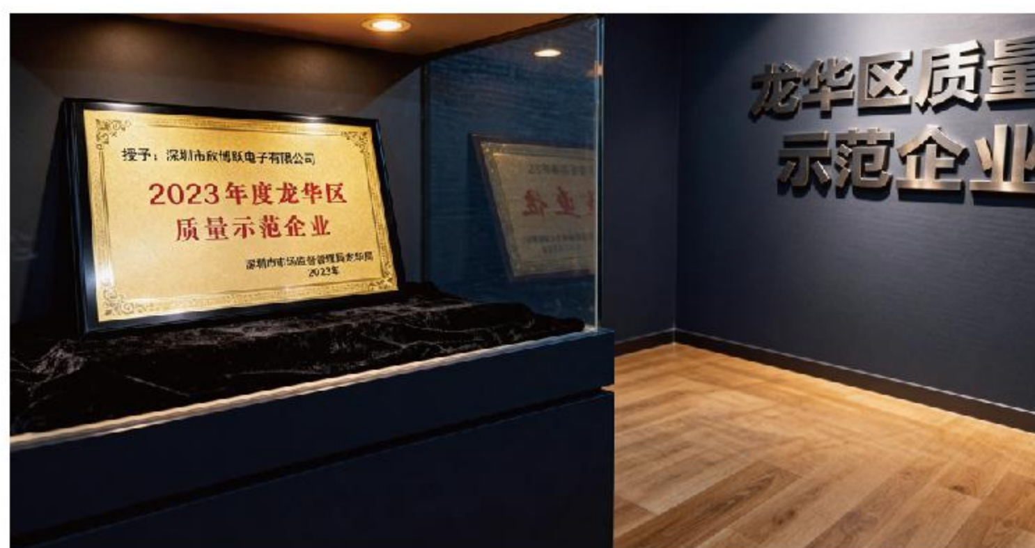
Quality Demonstration Enterprise