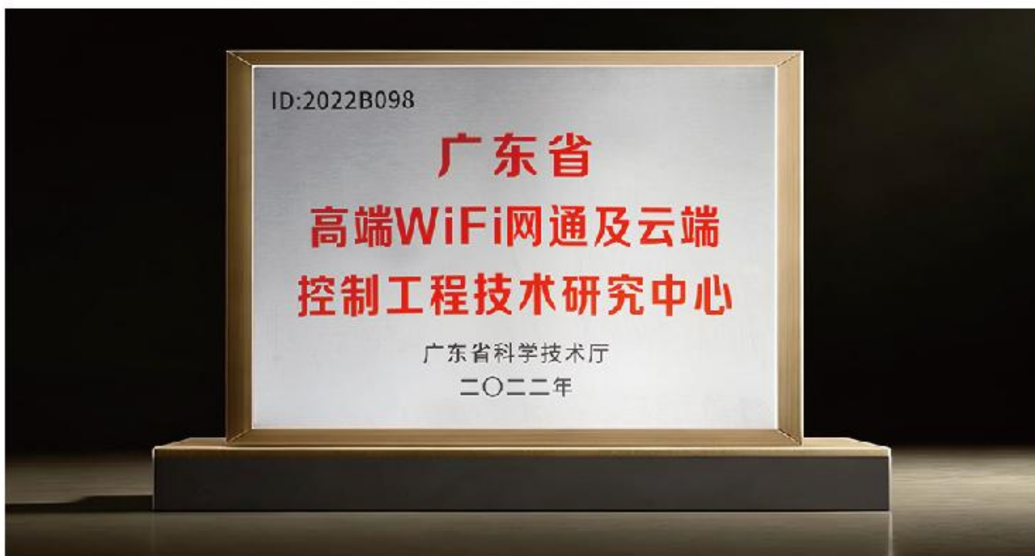
Research Center for High-End WiFi Networking and Cloud Control Engineering Technology