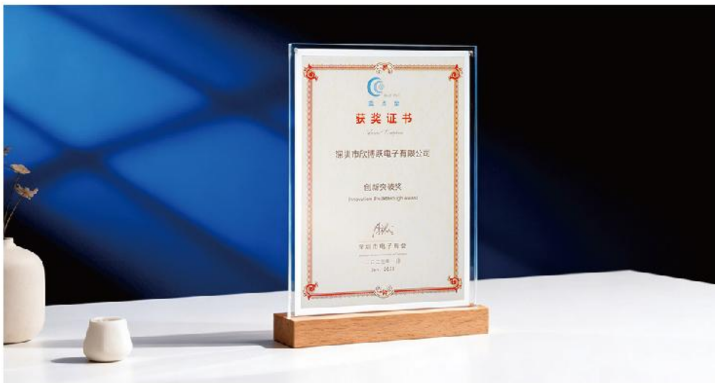
Blue Dot Innovation Breakthrough Award