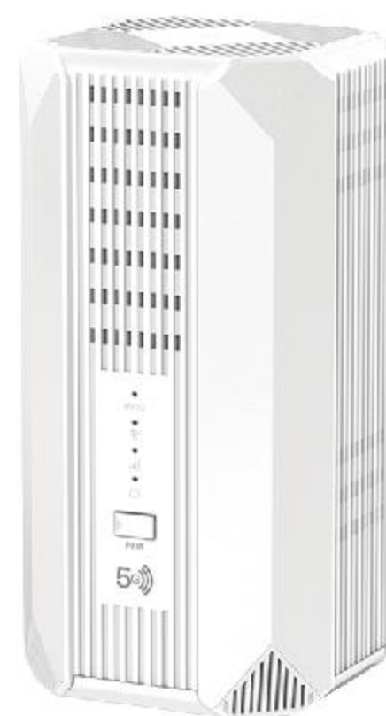
5G CPE Wi-Fi 6 AX3000 Wireless Router