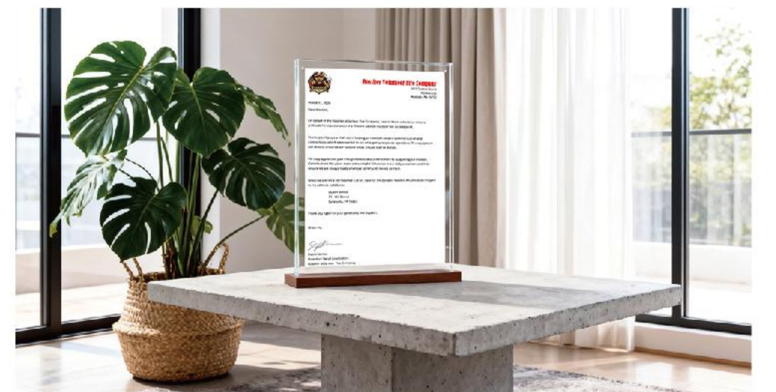
Donation for Rossiter Volunteer Fire Company