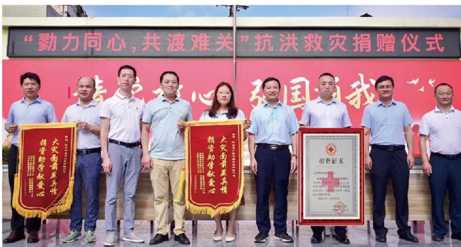
Donation for Flood Relief and Post-Disaster Reconstruction