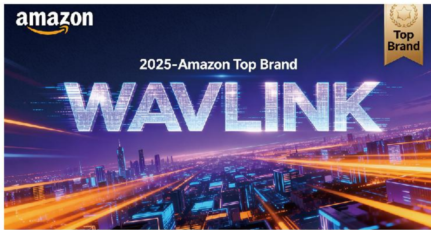
Wavlink is Amazon Top Brand