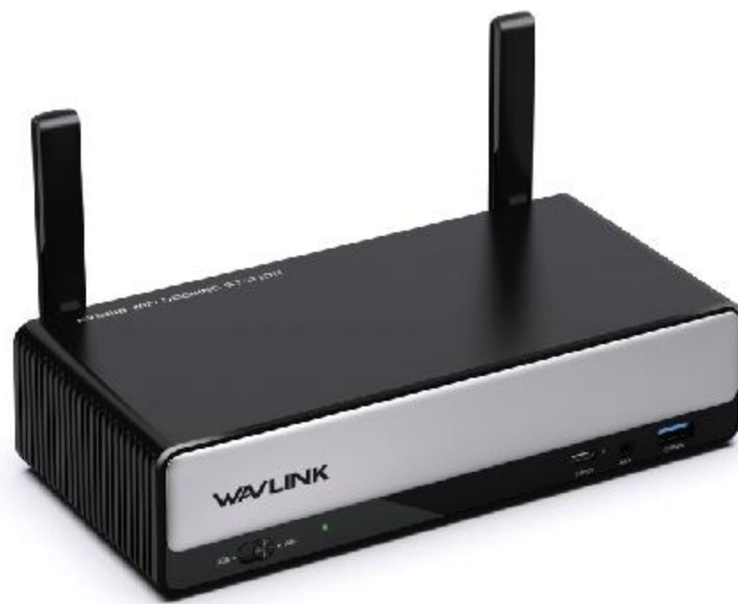
WiFi-based Wireless Docking Station