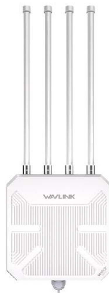
Wi-Fi 7 BE5100 Outdoor AP/Router