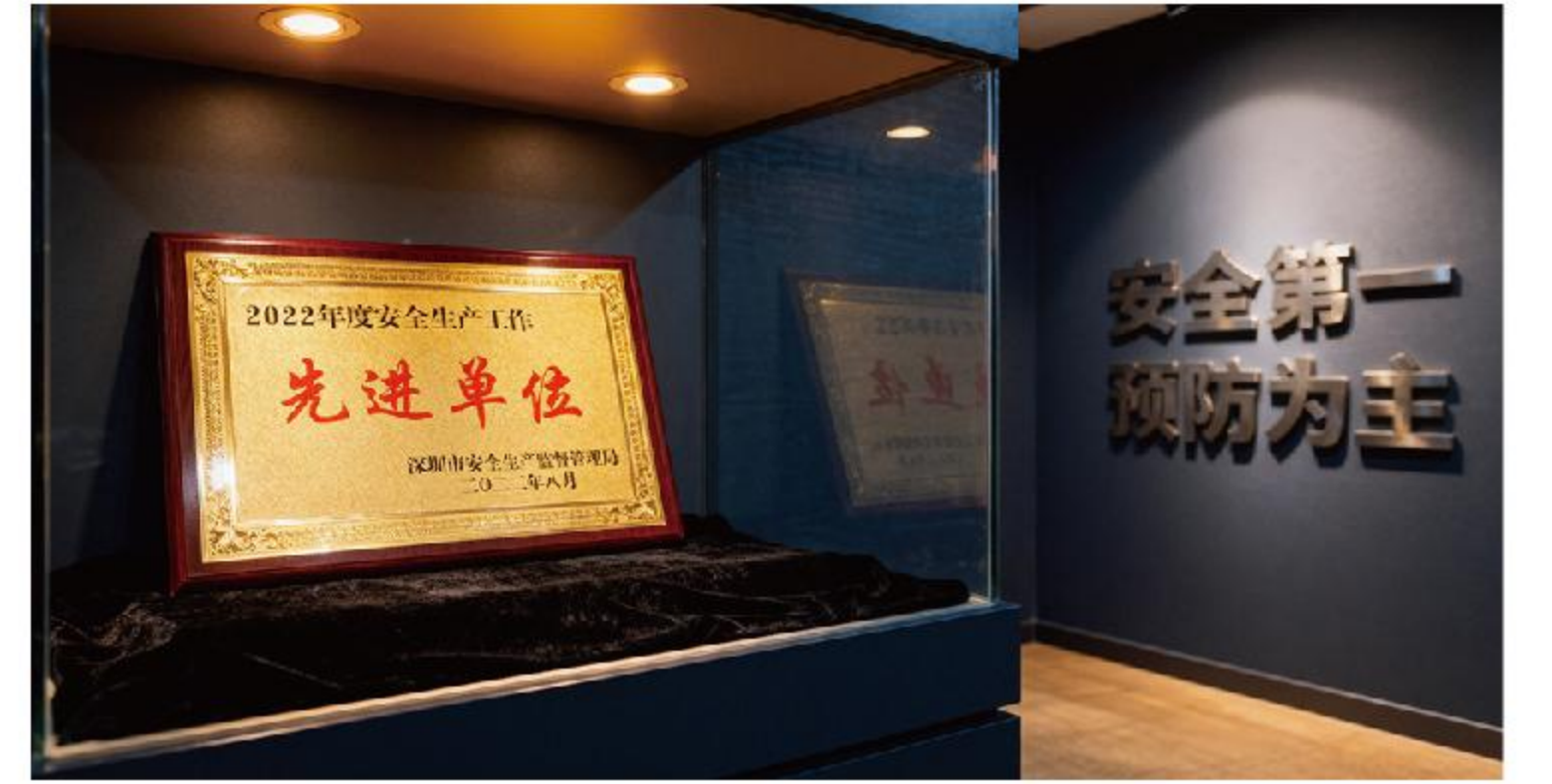
Advanced Company in Production Safety