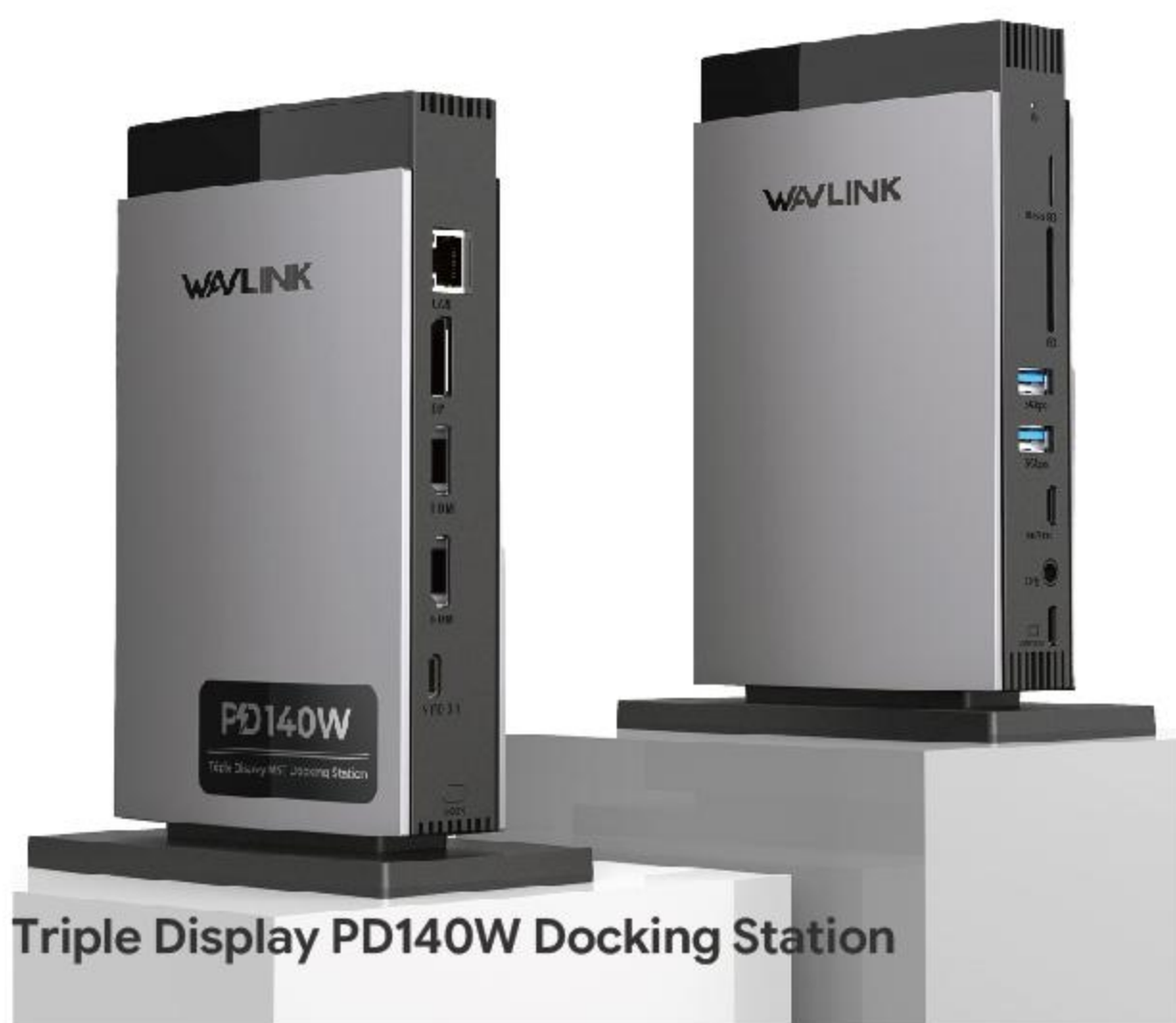
Triple Display PD140W Docking Station