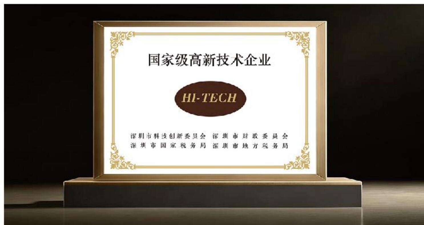
National High-Tech Corporation